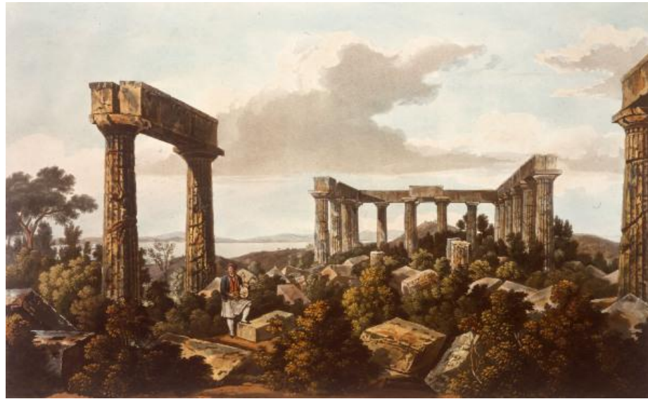
Fig 12. Edward Dodwell, Temple Aphaia, Aegina, Greece . Watercolor, 1819.

that the statue itself does not break into pieces as a result of these attempts!” (Ibid.) The reciprocal danger of such an unintentional “iconoclasm” on the side of the statue is what concerns Nietzsche: “The philologists perish from the Greeks — one could perhaps survive that — but antiquity itself reduced to shards at the hands of the philologists!” (Ibid)