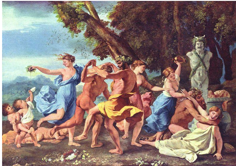
Fig. 10. Nicholas Poussin, Bacchanale devant une Statue de Pan , 1631. Source: London National Gallery.

of the general element in human life [ Generell-Menschlichen ], indeed of the universal element in nature [ Allgemein-Natürlichen ].” (Ibid.) This is the ecstatic and reconciling harmony of which Hölderlin speaks. 34 As Nietzsche writes here, this is the Dionysian as redeemer, dissolver of boundaries: “ Der Gott, ‘o λύσιος, hat alles von sich erlöst, alles verwandelt. ” [The god, ‘o λύσιος, has redeemed/released everything from himself, transformed everything.] (Ibid.) 35