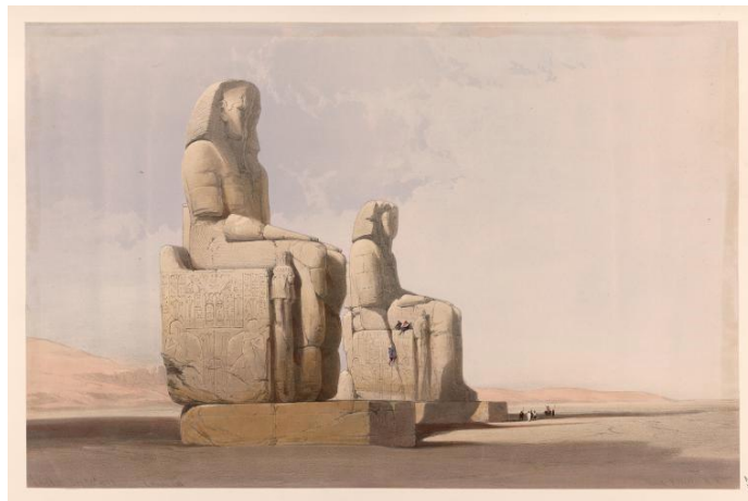
Fig. 2. The Vocal Memnon at Thebes; the colossal statues of Amunoph III. (1846-1849)

In his early notes, Nietzsche already conjoins light and sound by speaking of the sculptor god, Apollo in connection with music: “a divinity of light and sun god, and at the same time, the inventor and lord of tone.” 8 And this acoustic and no less luminous dynamic 9 also makes an appearance in his first book, The Birth of Tragedy where Nietzsche invokes the mythic account of Memnon's statues in Thebes, 10 the colossi known in antiquity as the “vocal” statues famed for sounding when struck by the rays of the rising sun. 11 This melding of the figurative and the literal is critical inasmuch as The Birth of Tragedy concerns the fusion or “marrying” of the domains of two divinities, Apollo and Dionysus.