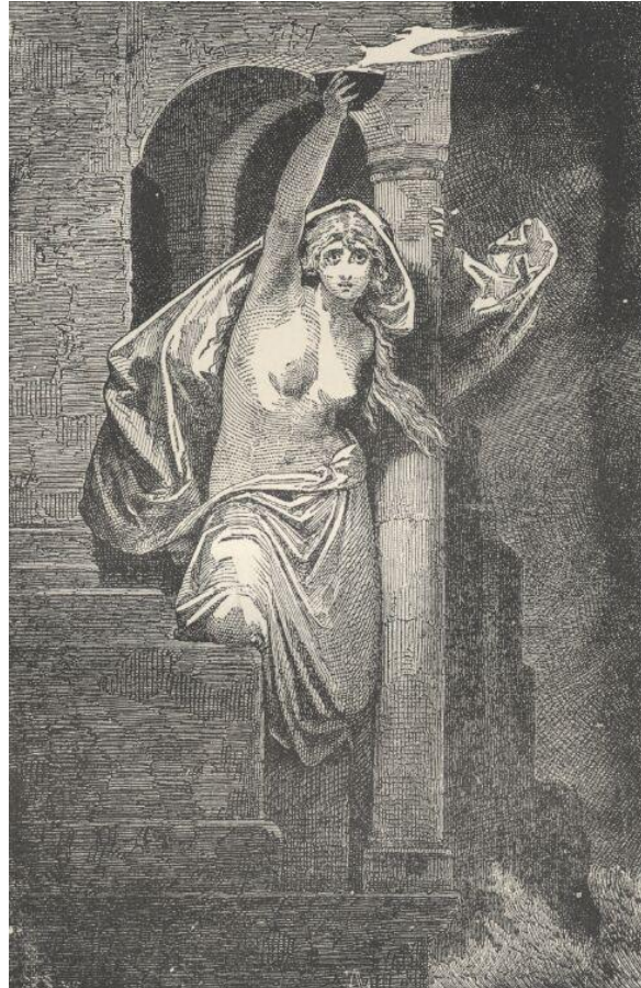
Fig 8. Illustration for Schiller’s “Veiled Images of Sais,” Project Gutenberg’s Poems of The Third Period , by Frederich Schiller . No original publication date given (ca 1900), no translator, no publication details available.

has yet uncovered. ” 30 Where the answer to the question, What is it, that is hidden behind this veil , returns with The truth... ” and adds a deflecting warning on attaining this ambition as on the lack of reticence in those who seek or pursue truth, thus Schiller contends that no mortal has succeeded in lifting this veil, a theme Nietzsche himself takes up in his first book with its reflections on science. 31