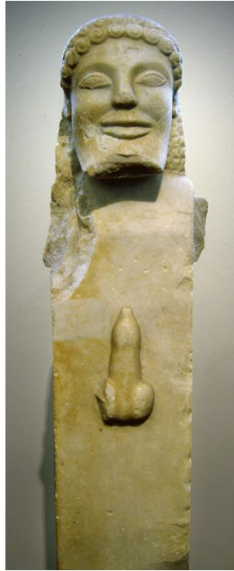
Fig. 7A. Marble herm, from Siphnos, dated late 6th century BC. Athens, National Archaeological Museum 3728.

Hermes also played an important role in fertility and other mystery rituals that are often invoked with reference to Alcibiades' supposed sacrilege of the figures of Sais. This last image is a striking one that leaves little to the imagination — arguably, so I contend, because we today really cannot imagine it.