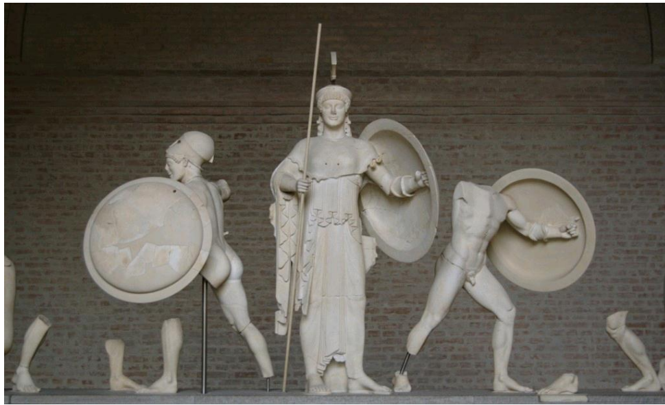
Fig 11. Aegina marbles, München Glyptothek.

text leaving out both music and the monumental. But the same Nietzsche whose paradigmatic breaking discovery in his own field had to do with the sound of ancient Greek, and thus of texts that would have to be sung rather than spoken, to which the imperative command, “to hear with one’s eyes” would be relevant in the first place, also was a student of the monumental, the fragment, the object. In the interim, this now archaeology, art history, but in Nietzsche’s day, it was the province of philology entire, and the special concern of his teacher (the one we usually fail to mention because he was also Wilamowitz’ own teacher) Otto Jahn. 48