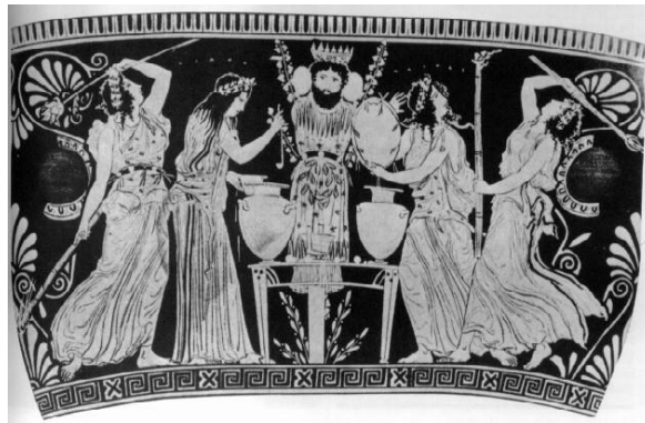
Fig. 7B. Dionysus depicted on a pole, with maenads performing sacrificial rites. Stamnos, Dinos Painter, 2419. Naples, Museo Archeologico Nazionale.

Hermes also played an important role in fertility and other mystery rituals that are often invoked with reference to Alcibiades' supposed sacrilege of the figures of Sais. This last image is a striking one that leaves little to the imagination — arguably, so I contend, because we today really cannot imagine it.