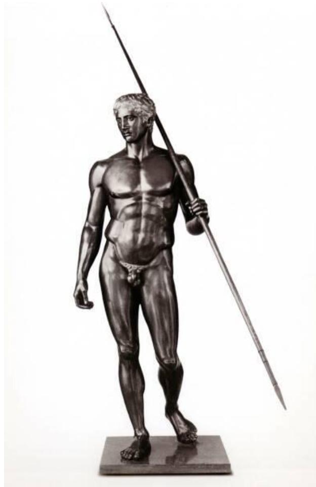
Fig 20. George Röhmer's bronze composite reconstruction of the bronze original, Polycleitos, 440 BC. Munich (destroyed in 1944).