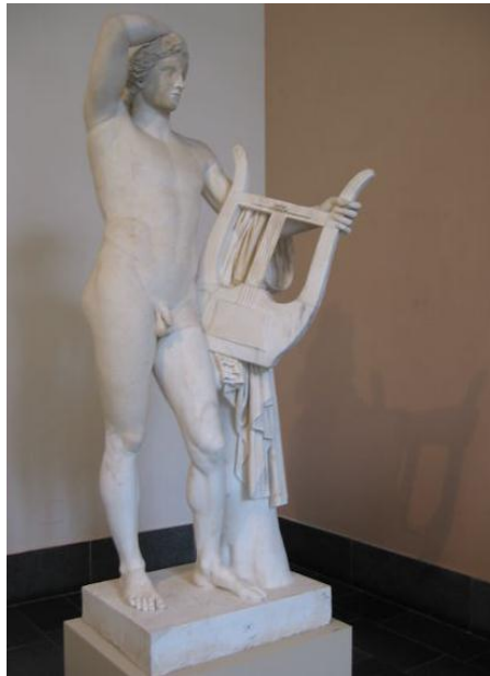
Fig 16. Apollo Kitharoidos, Roman copy Pergamon, Berlin.

Writing here on self-overcoming, Nietzsche also writes on the will to power, on the will to command and the will to obey. But he is speaking about self-overcoming and the paradox of the will to life and not “the ‘will to existence’” for “that will does not exist. For what does not exist cannot will; but what is in existence, how could that still want existence? Only where there is life is there also will, not will to life but — thus I teach you — will to power.” (Ibid.) What is the will to life as Nietzsche here contrasts it with the will to power?