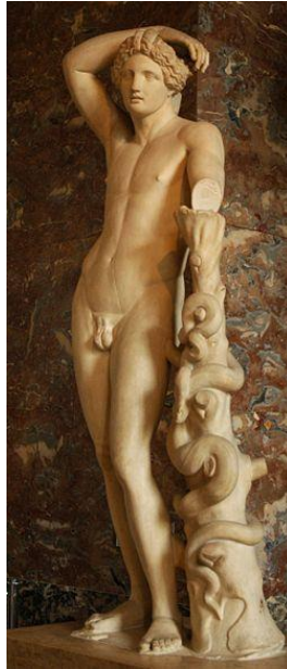
Fig. 15. Apollo Lykeios, Roman copy (after Praxiteles). Louvre, Paris.

In my reading and even more in personal correspondence and conversation, 72 I have discovered that the great majority of Nietzscheans are vastly more ginger about such things — pointing as they do to the Apollo Lykeios or else to the Apollo Kitharoidos and there are a range of similar statues to choose from. 73 In other words, most scholars who discuss this passage seem to imagine Zarathustra’s references to sculpture, when they think of it in a literal fashion, prefer to suppose a perfectly “classical” statue.