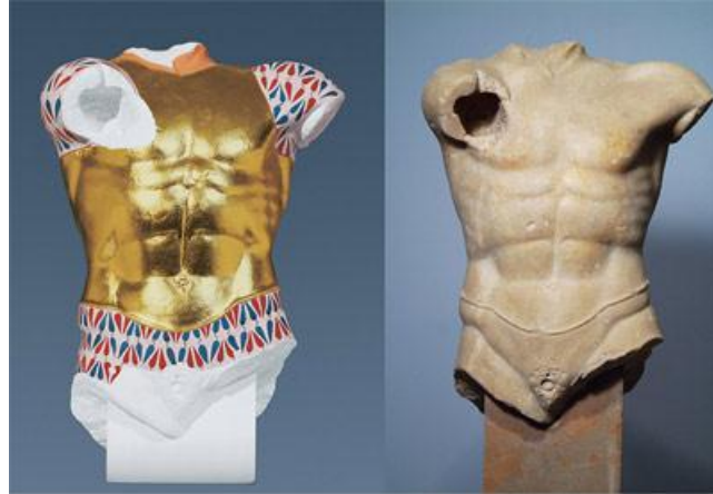
Fig. 4. Images drawn from the catalog edited by Vinzenz Brinkman's and Raimund Wünsche's Bunte Götter . Exhibit initially at Munich's Glyptothek. Source: GEOLino.de. Knallbunte Götter.

Although I elsewhere emphasize the importance of thinking of such life-sized sculptures in colored (and lacquered) bronze , 18 it is essential to note that Nietzsche's own references (here and elsewhere) make it plain that he imagined them of vibrantly polychromatic marble or else of painted terracotta and so on. 19