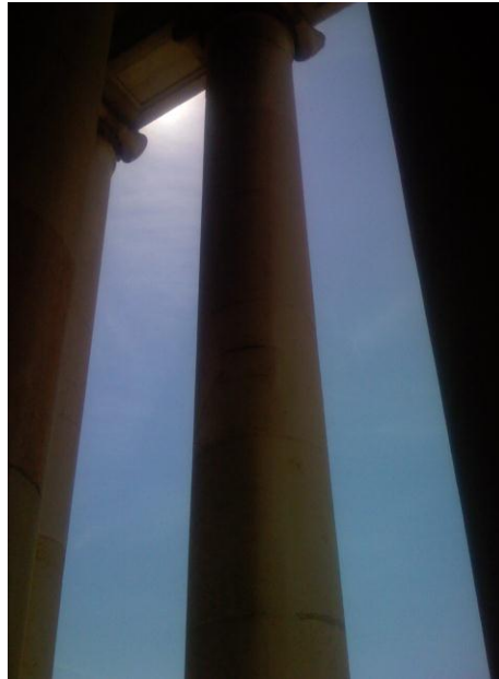
Fig 3. Ionic Columns, Munich, Germany.

“Walking under lofty Ionic colonnades, looking upwards to a horizon cut off by pure and noble lines, finding the reflections of his transfigured shape in the shining marble at his sides, and all around him, people solemnly striding or moving delicately, with harmoniously sounding lutes and a language of rhythmic gesture.” (BT §25)