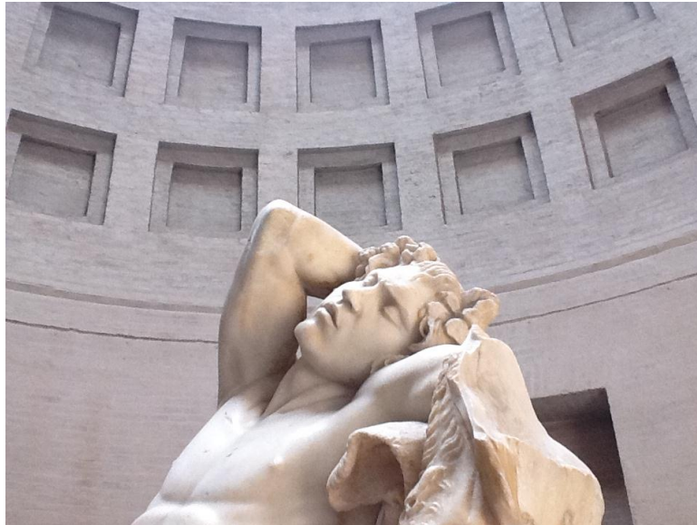
Fig. 19. Closer View: Barberini Faun (and dome), Munich, Glyptothek, May 2011

His arm placed over his head: thus should the hero rest; thus should he overcome even his rest. But just for the hero the beautiful is the most difficult thing. No violent will can attain the beautiful by exertion.