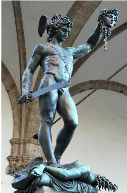
Fig 13. Benvenuto Cellini, Perseus with Medusa's head . Loggia dei Lanzi, Florence. Bronze. 18 ft high. 1545-1554.

genius throw in errors, vices, hopes, delusions and other things of baser as well as nobler metal, for the statue of humanity must emerge and be completed; what does it matter if here and there inferior material is employed. (HH I §258)