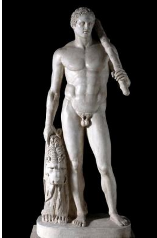
Fig 17. Hercules of Lansdowne, after Skopas J. Paul Getty Museum, Getty Villa Malibu.

collective taste and we can assume that Nietzsche has these in mind as he also in his notes writes of their “frosty” smiles [ archaisches Lächeln ]. 79