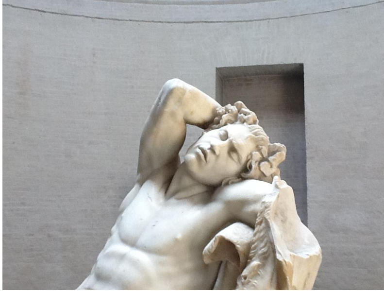
Fig. 18. Barberini Faun or Sleeping Satyr, ca. 220 BCE; marble. Munich, Staatliche Antikensammlungen und Glyptothek, May 2011.

and find him tasteful.” The key again is the sublime tension between ugliness and beauty and to this extent Nietzsche’s Zarathustran reflections on sublimity are also reflections on his own discipline of classical philology and the “science” as he calls it of aesthetics: “you that are sublime” he writes “shall yet become beautiful one day and hold up a mirror to your own beauty.”