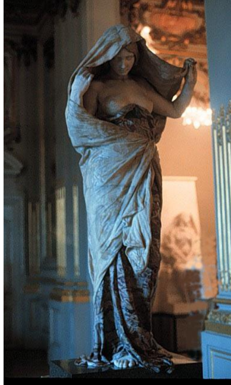
Fig 9. Louis-Ernest Barrias, Nature Unveiling Herself Before Science , 1899. Source: Musee d'Orsay, Paris.

What is true is that any time we speak of boundaries — and we do not need Derrida for this as Plato had already emphasized (here by way of a joke) this same trope of naming/un-naming in the Republic (479c) and Nietzsche himself makes the same assertion in his discussion of Anaximander in Philosophy in the Tragic Age of the Greeks — we are always already in the doubled realm of transgression and hence of theft and that means cunning or deception. We recall that Hermes, like Apollo, is brother to Dionysus and like Dionysus, Hermes is the trickster god, like the Norse Loki. 32 Hermes, winged feet or not, crossing as he does, the boundaries of the worlds of those above and below, the quick and the dead, the human the divine, is not accidentally associated with hermeneutics, the art of interpretation. One needs all the help one can get when dealing with the gods and perhaps never more so than when dealing with their messenger. 33