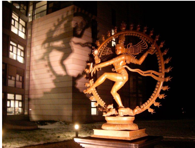
Fig. 14. Dancing Shiva, near CERN, Geneva. Gift of the Department of Nuclear Energy, India, 18 June 2004.

we have mentioned above, which is part of the reason they would sometimes be covered, sometimes festively, sometimes protectively. 63 In place of primitive skill or a lack of competence developed from a quasi-embryonic potential, as he speaks of it against traditional conceptions of art-history, Nietzsche suggests that another and different relationship with the divine is at work in antiquity.