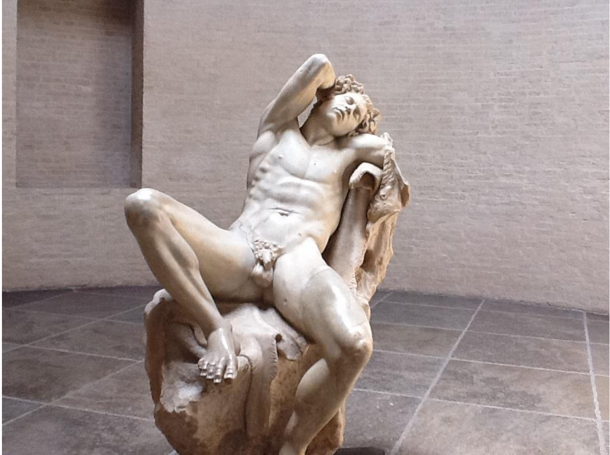
Fig. 21. Barberini Faun, Munich, Glyptothek, May 2011.