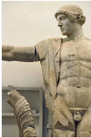
Fig. 1. Apollo from the Temple of Zeus, Olympia, 5th century, BCE Archaeological Museum, Olympia Greece.

From the beginning of his The Birth of Tragedy out of the Spirit of Music , a book most of his colleagues and readers failed to understand to his enduring frustration — and a book that, so I argue, remains poorly understood to this day — Nietzsche refers to sculpture and the dream, speaking of Apollo, who is also associated with the dream divination and the Pythian oracle.